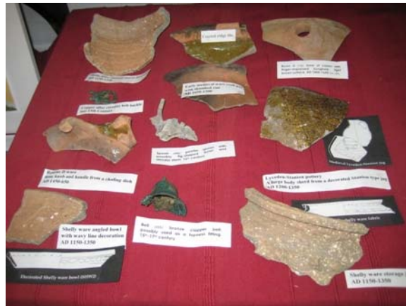
Archaeology and interpretation of Cumbergate artifacts

Vacant shops can become vibrant spaces, if you are an agent or landlord who would be interested in working with arts and heritage groups to use your vacant properties please contact the Heritage Regeneration Officer on 01733317480 or alice.kershaw@peterborough.gov.uk