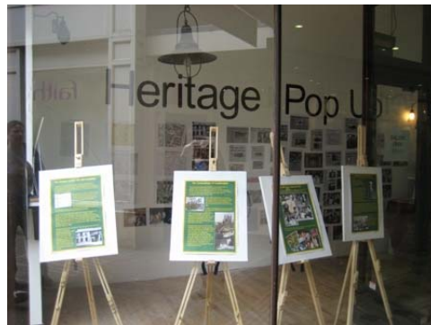
Panels on display in the window, turned around for the open day.

Four panels listing the history of the Old Still pub, area and the people who have worked within and owned the building were on display.