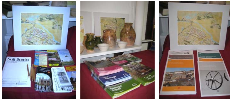
Information on Display from HAG, EH and HLF

There was an exhibition on the back wall and in the interior space which consisted of information from English Heritage (EH) The Heritage Lottery Fund (HLF) and the local Heritage Attractions Group (HAG).